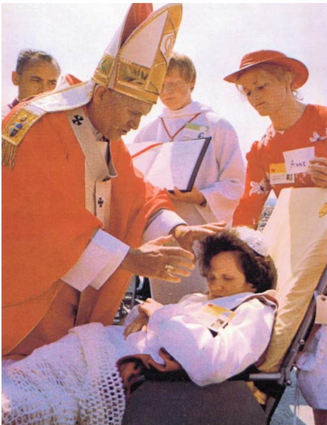
Confirmation at Coventry, 30 th May 1982