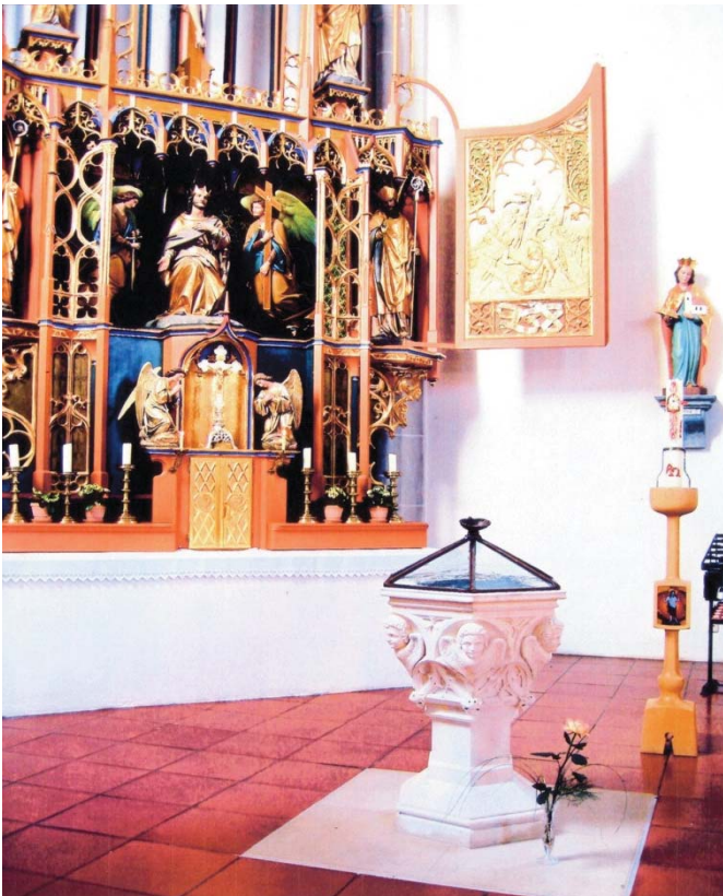
The shrine of St Oswald and font at Markt am Inn

Edwin laid the foundations of the new church at York where Paulinus was appointed the first Bishop.